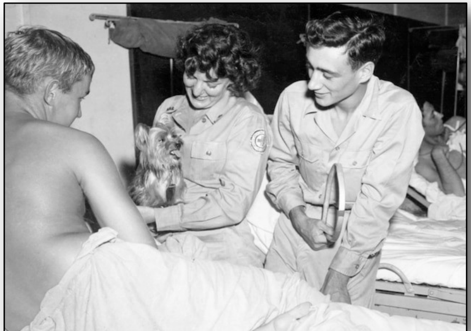
A Red Cross worker brings Smoky on patient rounds at a U.S. Army hospital. The four-pound Yorkie became a popular and effective diversion for wounded men in the Philippines as well as back home after the war.

Eventually, he trained her to walk a tightrope, ride a handmade scooter, and even "spell" her own name—Smoky would pick up the large cutout letters in her mouth as he called them out to her.