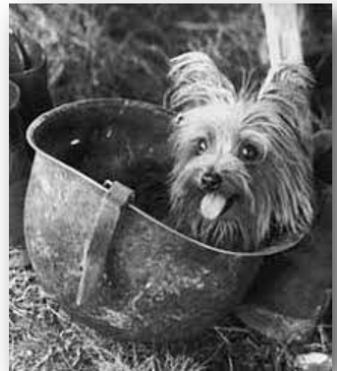
U. S. Army "Corporal" Smoky