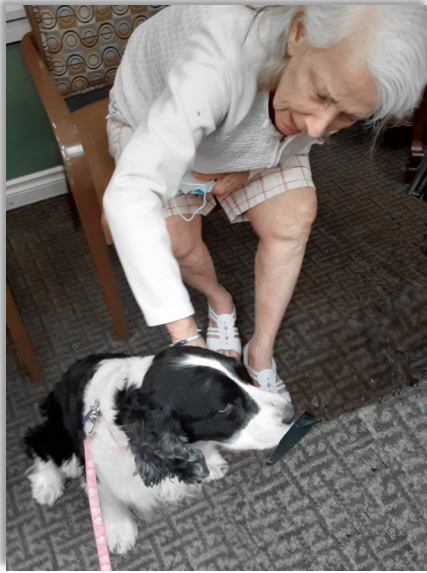
Encore at Parkland Memory Care Center