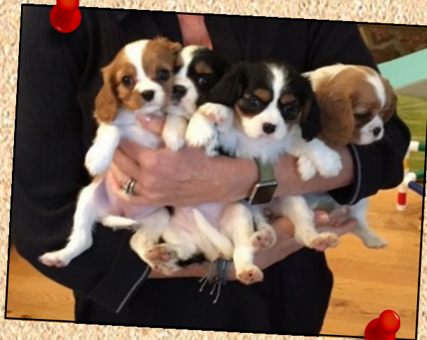
"Sinders' Puppies" Sinders is Hope'Bennett's Cavalier