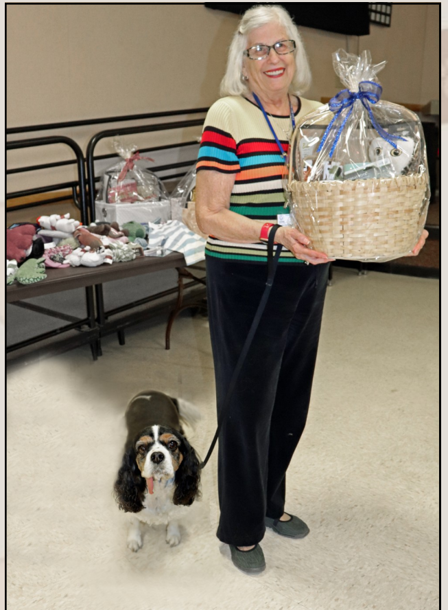
Cookie & Hope