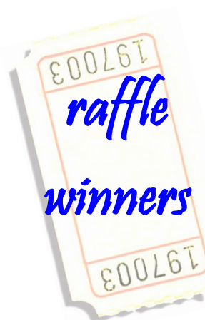
Hope & Cookie