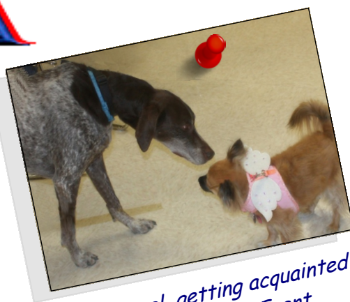
Cinder and Angel getting acquainted at this year's Annual Event

To Our Membership: We were delighted to host the annual celebration event with our pet therapy teams and general membership, to thank you for all of your support and time volunteering.