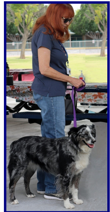
Rene and Lady